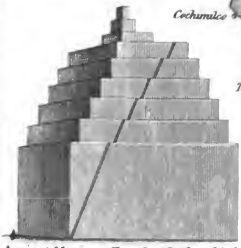
Ancient Mexican Temple 170 feet high